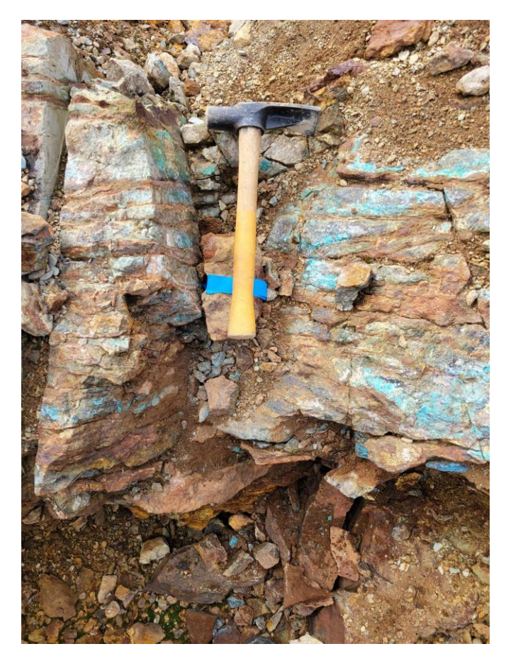
Figure 2 : Sample site E078416; 35.4 grams per tonne gold and 1.5% copper.

The Southmore property is prospective for porphyry copper-gold mineralization as well as associated peripheral base and precious metal skarn deposits associated with the contacts of intrusives with carbonate host rocks. Skarn deposits can occur as exceptionally high-grade orebodies within broad areas of skarn development as observed at Southmore. Soil geochemistry, especially in the southern part of the property where outcrop is sparse, has been shown to be useful in delineating potential mineral zonation within the skarn mineralization. Going forward, grid soil geochemistry and geological mapping over the most prospective areas is planned, followed by drilling of identified targets.